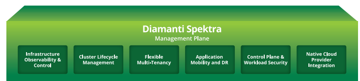
Figure 1: Diamanti Spektra™ at a Glance